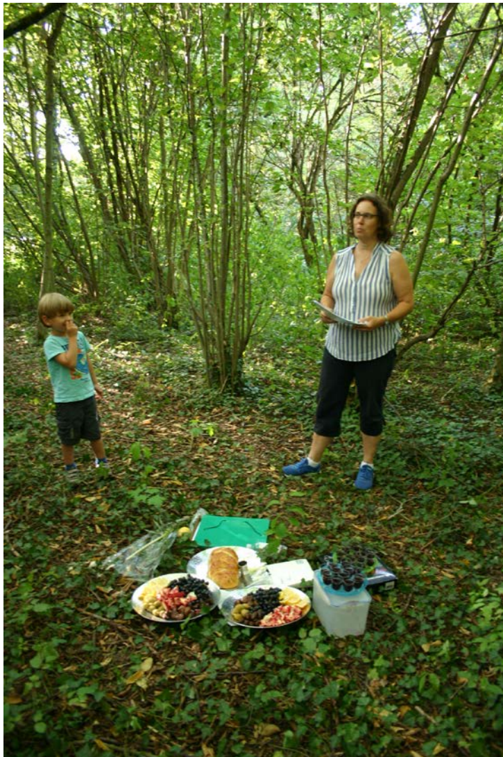
Eating under trees with a traditionell kiddush