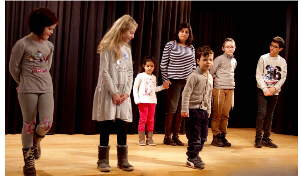
„We are one family!“ - pupils discover their religious roots, Heidelberg, 2020