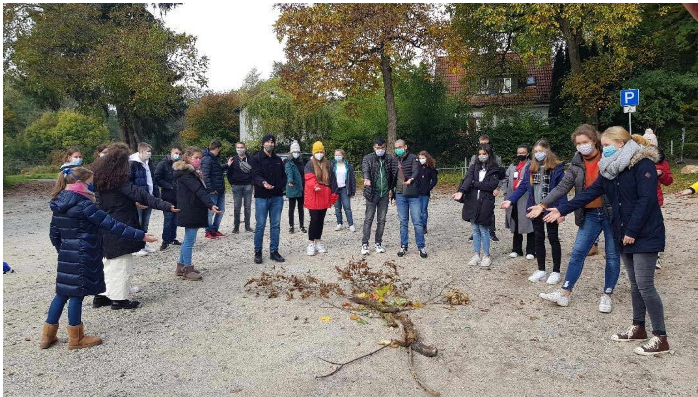
„We and the trees“ - all living beings created by God, October 2020