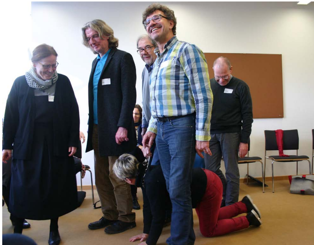
„Abraham and his people having a walk in the dessert“ - workshop with teachers and community workers, 2019