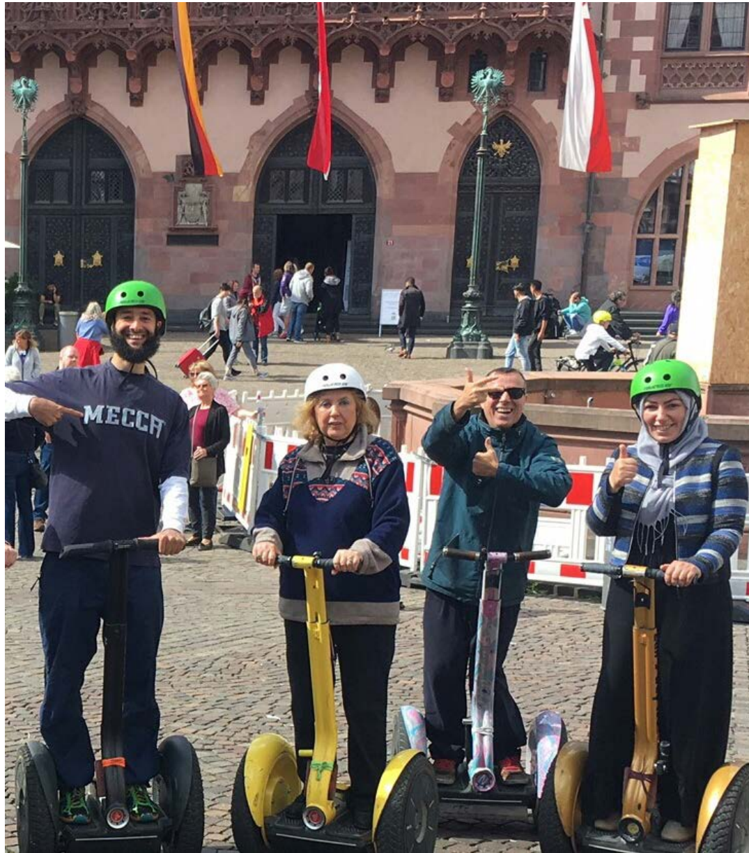
An Abrahamic Team on tour in Frankfurt/Main