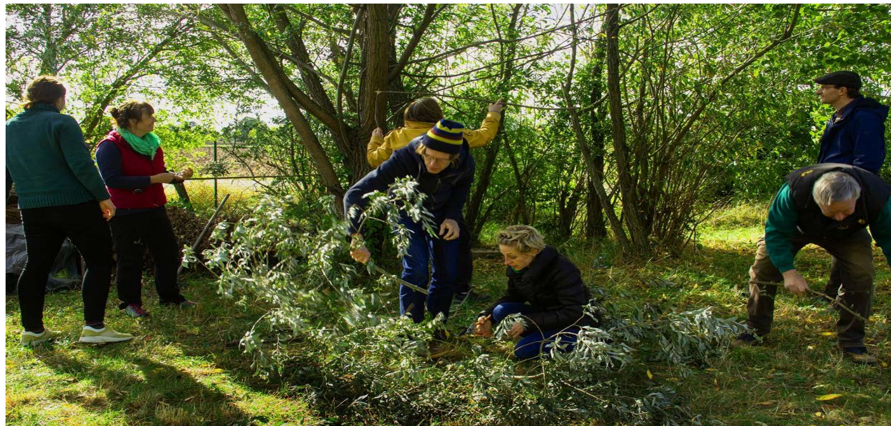
collecting material and constructing a sukka Ladenburg, October 2020