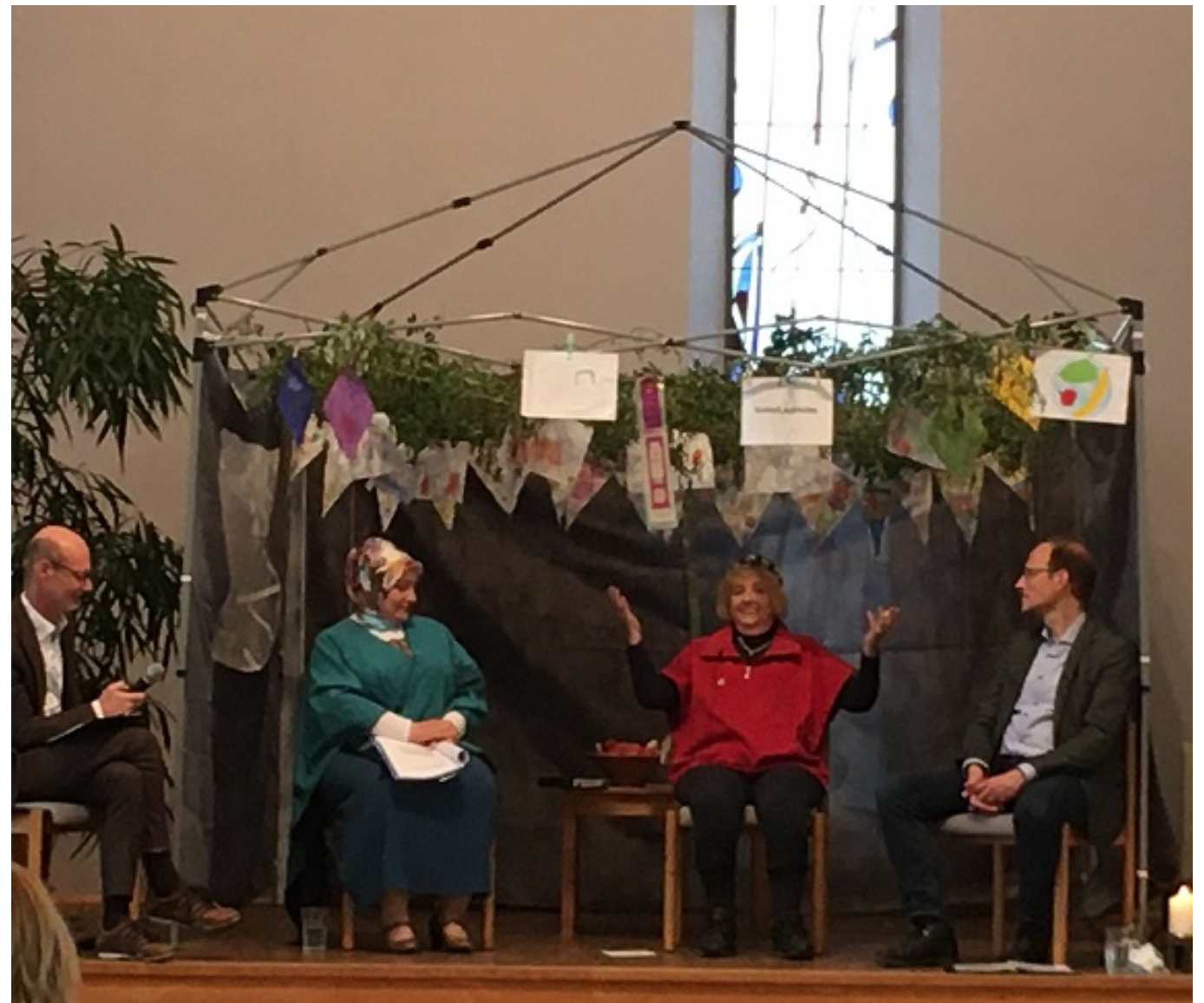
A chat under the sukka in a church of Frankfurt, October 2020