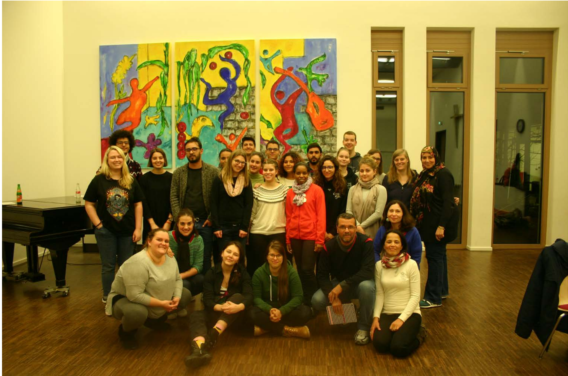
Abrahamic Team meets students from Tunisia within an interreligious exchange in Öhringen, South-Germany, December 2019